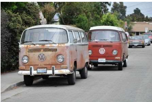
More new friends