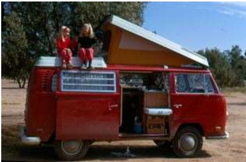
Morocco, Africa 1970

Please take a few moments to learn more about this well traveled and storied bus. It was purchased by a couple in San Francisco in 1970. Picked up in Gütersloh, Germany they traveled 20,000 miles over a period of six months with their two daughters and then returned to California with the bus where it became their family car for the next 27 years.