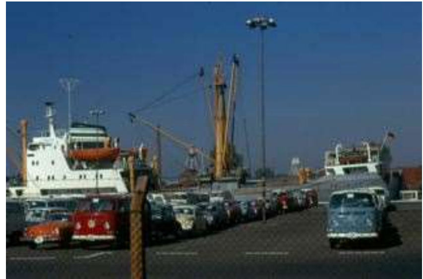
Bremen , 1970