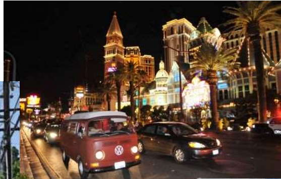
Las Vegas, NV