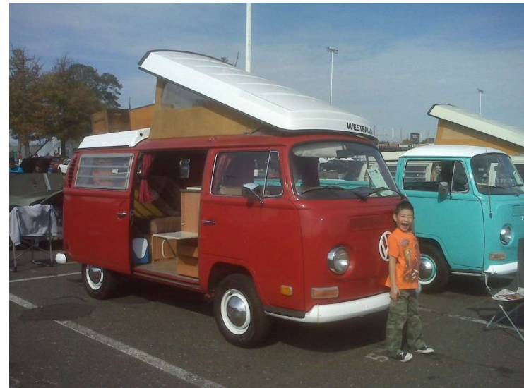
Englishtown, New Jersey 2010